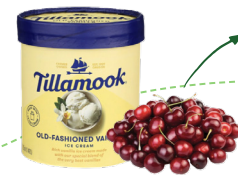
Tillamook Old- Fashioned Vanilla Ice Cream

Aléh recommends blending with Sprouts fresh cherries for a fresh summer milkshake!