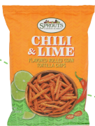
Sprouts Brand Chili & Lime Rolled Tortilla Chips