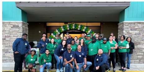
Store #854 in Philadelphia, PA