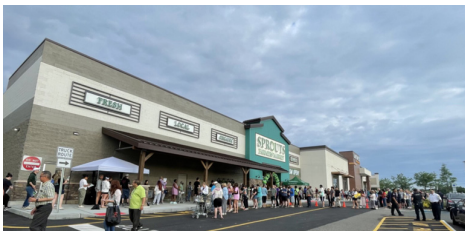
Store #947 in Aberdeen, NJ

WE ARE PROUD TO HAVE RECENTLY WELCOMED 5 NEW STORES TO THE SPROUTS FAMILY IN Q2!