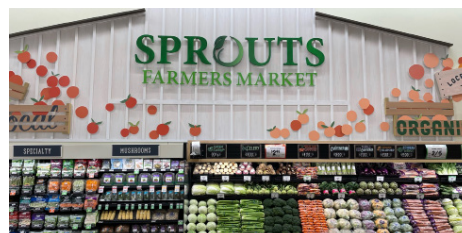
Store #167 in Fort Worth, TX