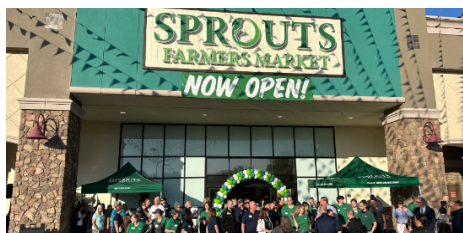
Store #51 in Phoenix, AZ