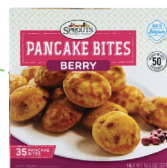
Sprouts Brand Berry Pancake Bites