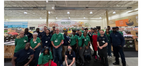
Store #855 in Philadelphia, PA