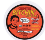
Chipotle Bitchin Sauce