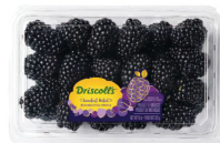
Driscoll's Sweetest Batch Blackberries