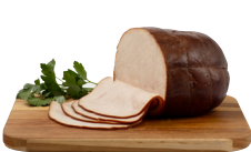
Smokehouse Turkey Breast

Perfect for sandwiches or snacks, all are free of artificial ingredients and contain no MSG or added phosphates, nitrates or nitrites. With delicious options like chicken breast , roast beef , two varieties of ham , and three varieties of turkey breast , you won't be able to decide on your favorite.