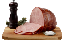
Black Forest Ham