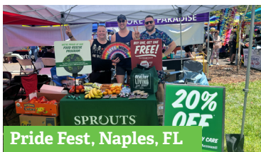
Pride Fest, Naples, FL

Head over to The Vine to find more customer compliments ! You might discover you’ve gotten a shout-out from a happy customer!