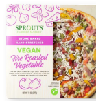
Sprouts Fire Roasted Vegetable Vegan Pizza

The Sprouts Healthy Communities Foundation will make a $2,500 donation on Jan's behalf to Delray Beach Children's Garden , an organization that nurtures eco-consciousness in children through garden education, nature exploration, and outdoor play.