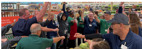
Store #643 in Delray Beach, FL