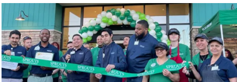
Store #459 in Lancaster, CA

WE ARE SO PROUD TO HAVE RECENTLY WELCOMED FIVE NEW STORES TO THE SPROUTS FAMILY IN Q2!