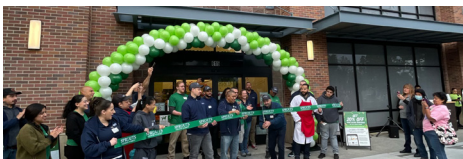
Store #463 in San Jose - Coleman Ave, CA