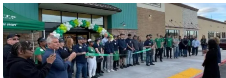
Store #561 in North Las Vegas, NV