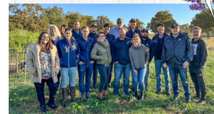
SPROUTIES TAKING PART IN THE REGENERATIVE RETREAT