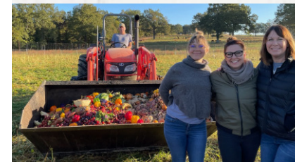
TAKING IN THE WORK OF THE TRASH TO TREASURE PROGRAM

Learn more about Ancient Nutrition at https://ancientnutrition.com/