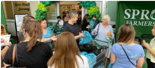
Store #640 in Port St. Lucie, FL

WE ARE SO PROUD TO HAVE RECENTLY WELCOMED FOUR NEW STORES TO THE SPROUTS FAMILY!