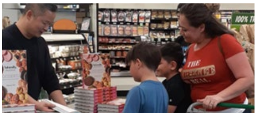
Store #447 in Morena Valley, CA