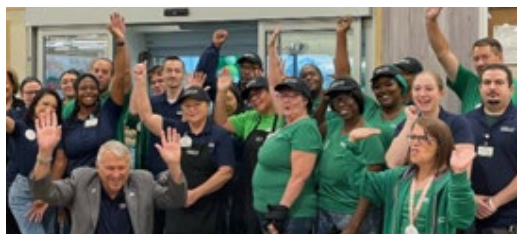
Store #646 in Apopka, FL