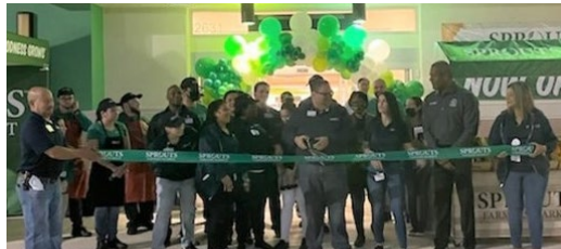
Store #641 in Homestead, FL