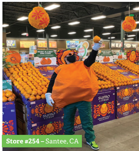
Store #254 – Santee, CA