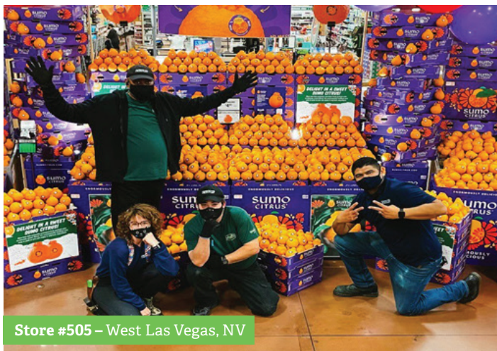
Store #505 – West Las Vegas, NV