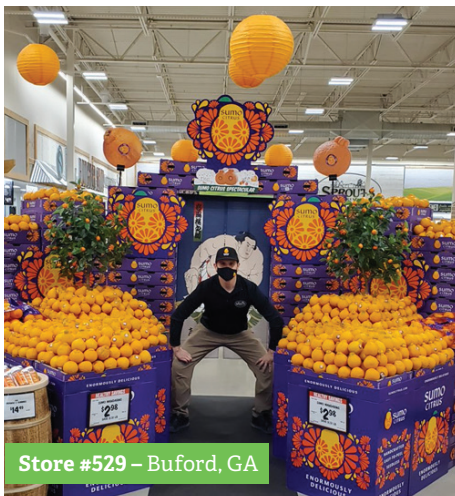
Store #529 – Buford, GA