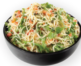
Lemon Capellini Pasta Salad