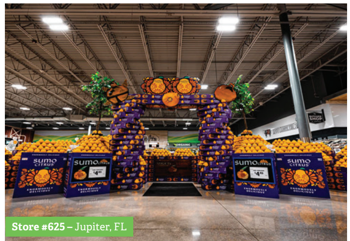
Store #625 – Jupiter, FL