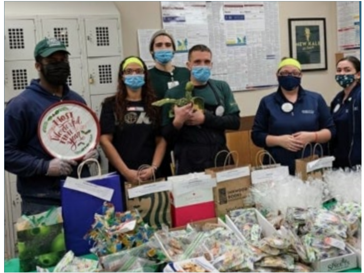
The team at store #945 – Marlton, NJ , severed some sweet treats as they celebrated national cookie day on December 4.