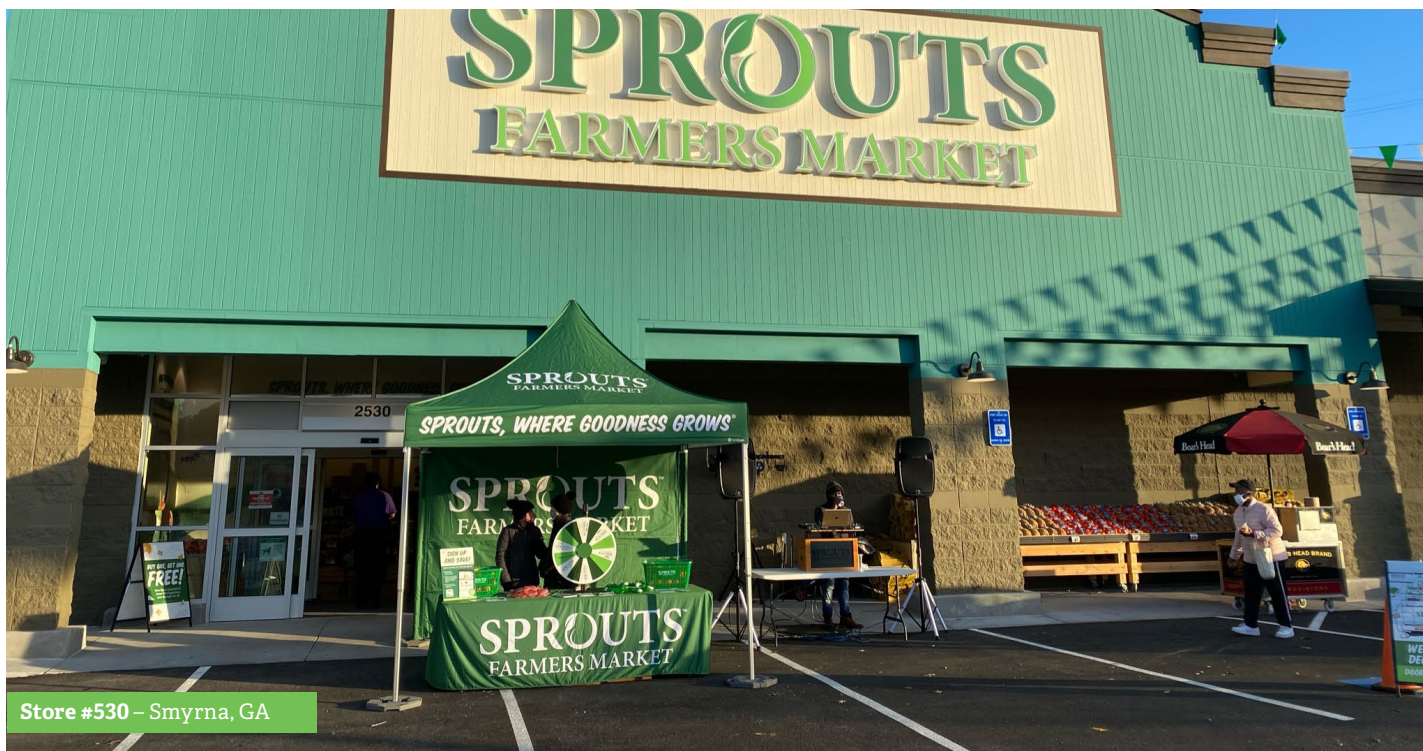
Store #530 – Smyrna, GA