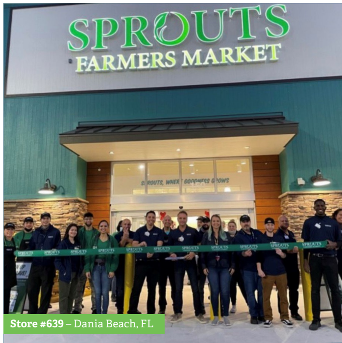
Store #639 – Dania Beach, FL