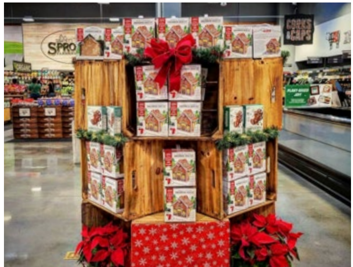
Gingerbread houses are HERE! Shoutout to store #621 – Oviedo, FL , for bringing the holiday spirit.