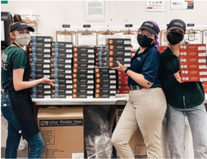
Happy pie season from the Bakery department at store #43 – Mesa, AZ!

The holidays are here and many of our team members are spreading holiday cheer!