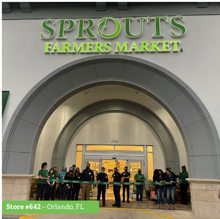
Store #642 – Orlando, FL