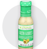
Primal Kitchen Green Goddess Salad dressing