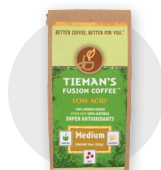
Tiehan's Fusion Coffee