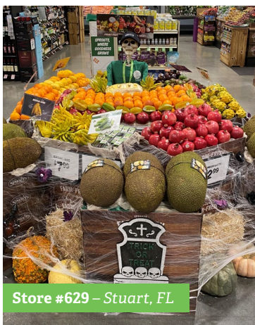
Store #629 – Stuart, FL