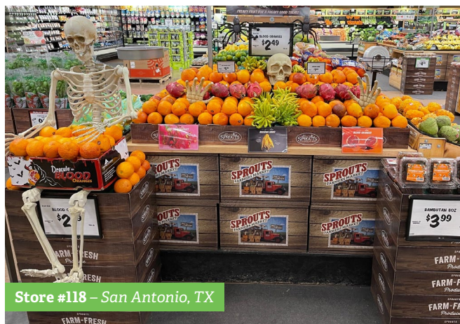
Store #118 – San Antonio, TX