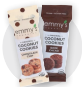
Emmy's Organic Coconut Cookies