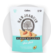
San Joaquin Sea Salt Chips