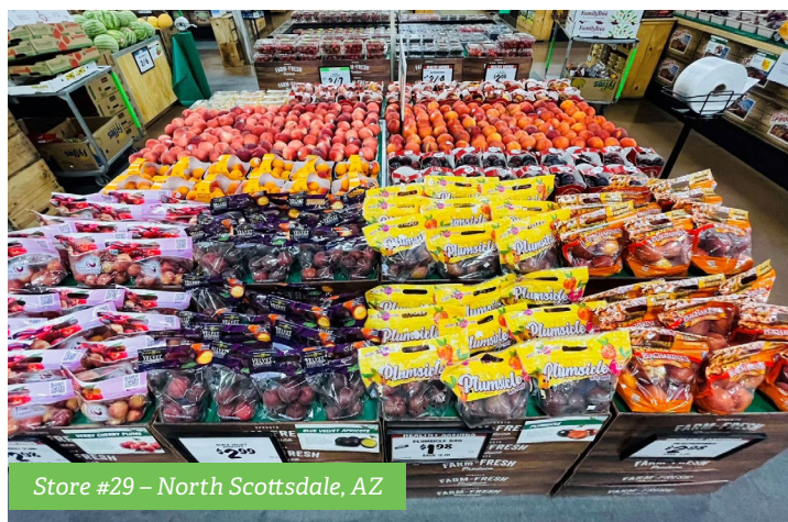
Store #29 – North Scottsdale, AZ

Plus, check out some of these amazing displays currently in our stores!