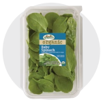
Sprouts Organic Baby Spinach