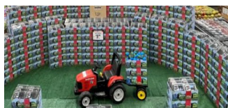
3rd place: store #265 – Modesto, CA