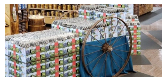
2nd place: store #310 – Arvada, CO