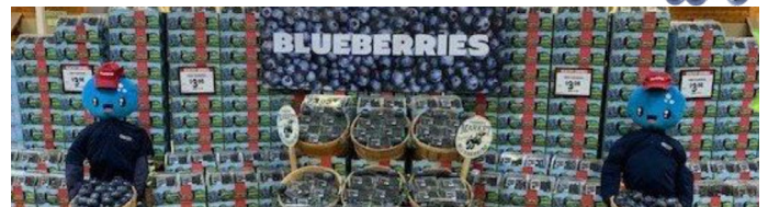
1st place: store #526 – Marietta, GA