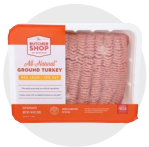
Sprouts All-Natural Ground Turkey