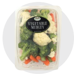
Sprouts Vegetable Medley