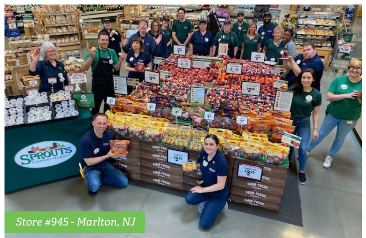
Store #945 - Marlton, NJ