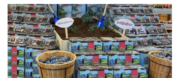
3rd place: store #615 – Naples, FL