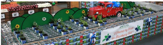
1st place: store #412 – Goleta, CA