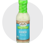
Sprouts Organic Ranch Salad Dressing