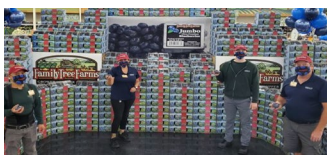
2nd place: store #18 – Phoenix, AZ